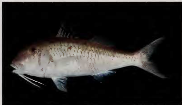
Fig. 2. Parupeneus heptacanthus , HUJ 8330, 225 mm SL, Gulf of Aqaba, Red Sea.

spine where it emerges from the body (not the internal base); body width is the maximum width just posterior to the gill opening; orbit diameter is the greatest fleshy diameter, and interorbital width the least bony width; cheek depth is measured from the lower fleshy edge of the orbit vertically to the ventral edge of the preopercle; upper-jaw length is taken from the front of the upper lip to the posterior end of the maxilla; depth of the maxilla is the maximum vertical fleshy depth; barbel